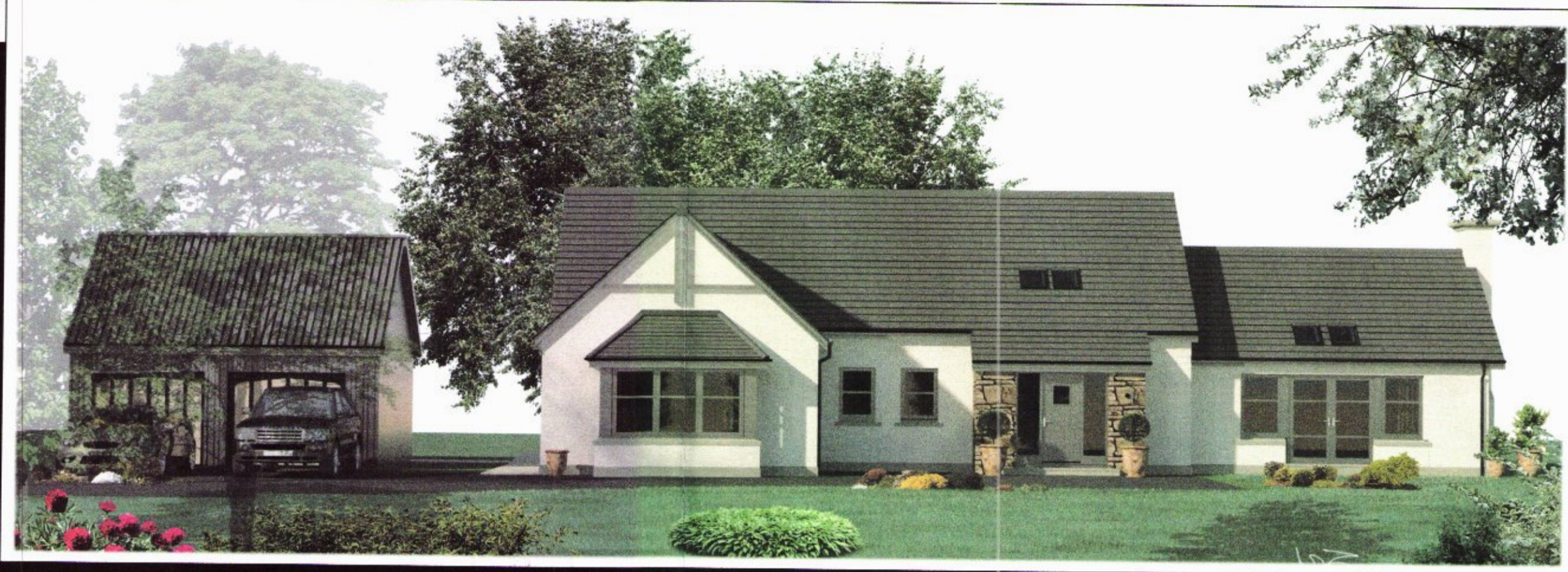
TYPICAL 3D IMAGE OF HOUSE DESIGN Produced using TurboCAD V 21 professional, 3DS max design 2014 and Photoshop CS