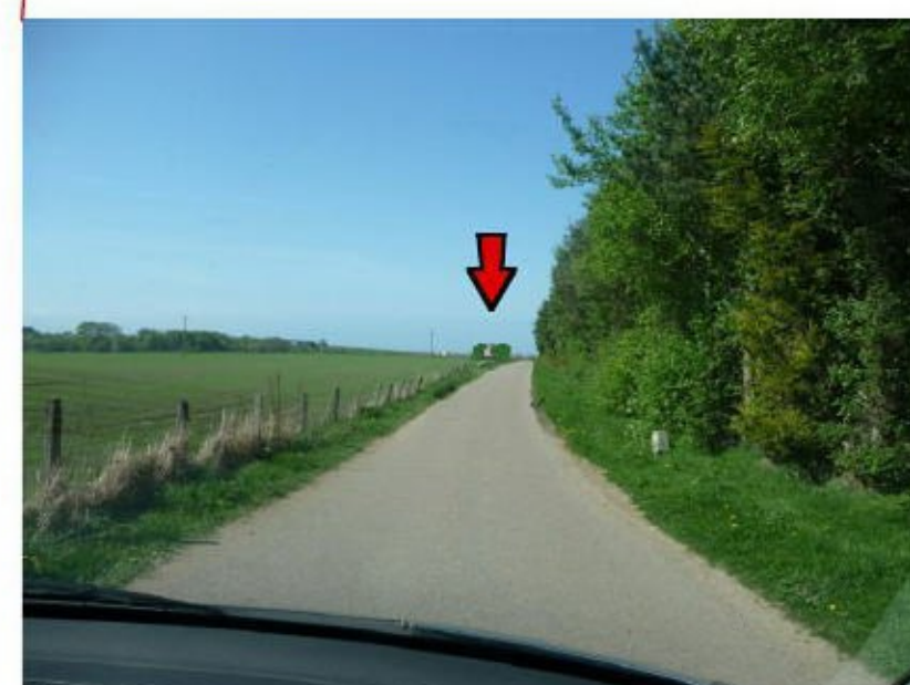
Photo "C". - View from C671 Minor Access Road - Northwards. (camera held at eye level within car)