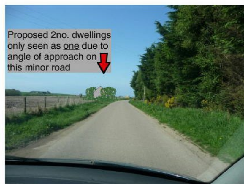
Photo "D". - As "C" but closer. (camera held at eye level within car)