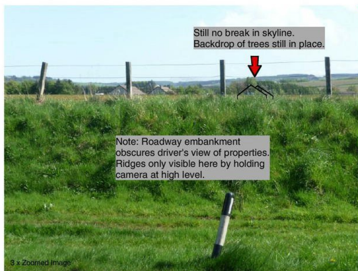
Photo "F". - View from A98 (Camera held above head height whilst standing to see ridges of existing houses. No view possible of existing or proposed from driver's eye level.)