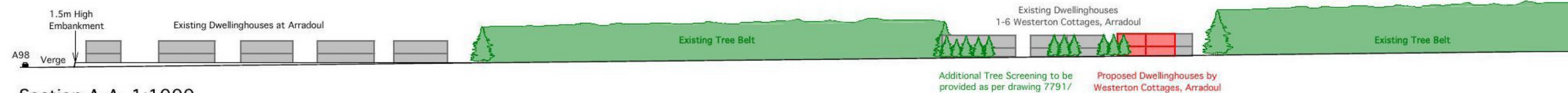
Section A-A, 1:1000