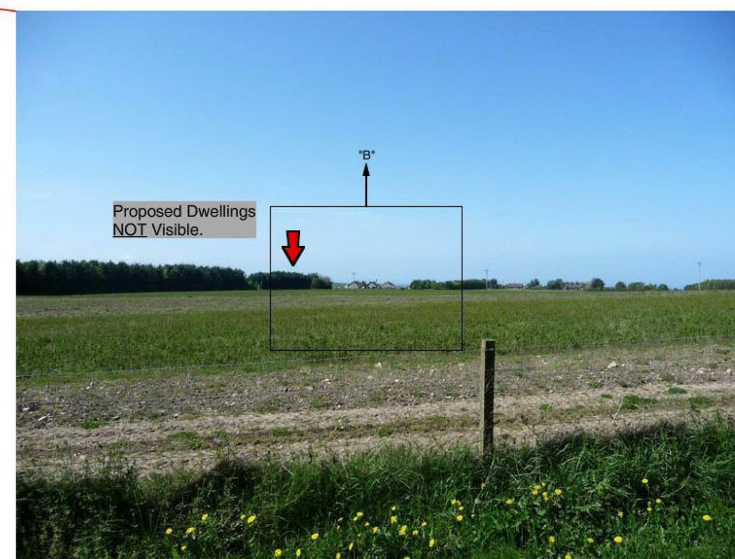
Photo "A". - View from Private Farm Access Road. (camera held at arms length above head whilst standing)