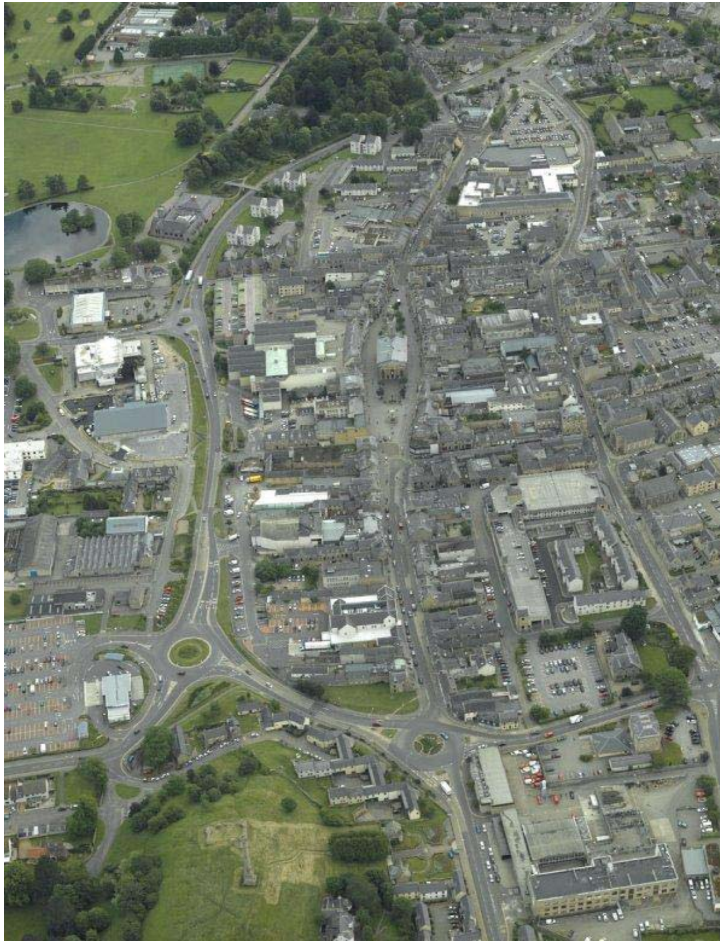
Aerial photograph from west - Lossie Green separated from the High Street by the A96 bypass