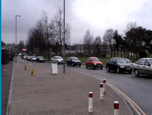
Main Street Southbound to Roundabout