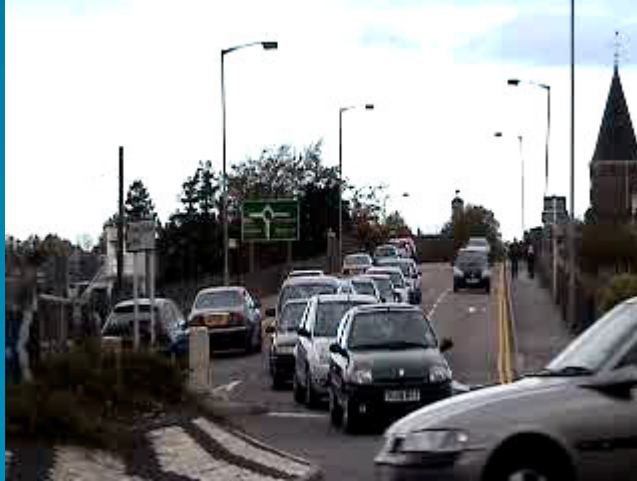
New Elgin Road