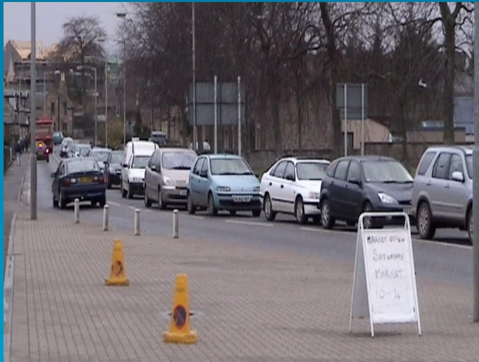
A941 New Elgin Road