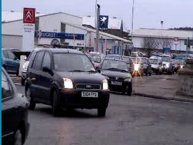
Station Road Westbound to Roundabout