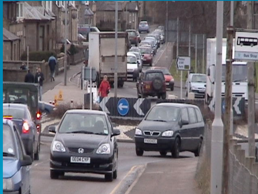
New Elgin Road