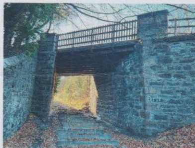
General view looking south