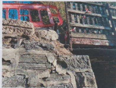
Damage to wingwall under missing pilaster