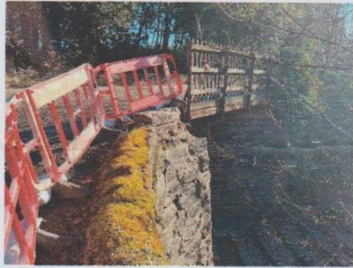
Missing pilaster on SW corner