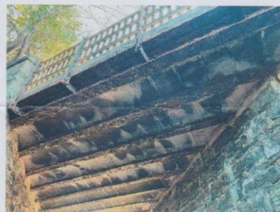
General view on beams and jack arches