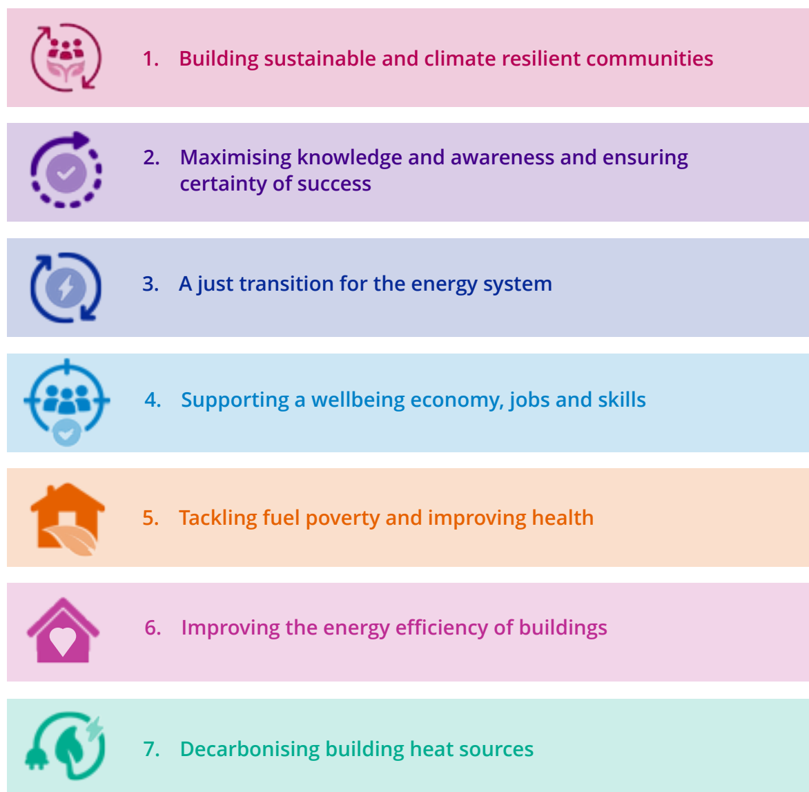
Table 1. LHEES priorities for Moray.

It has been developed in collaboration with key stakeholders to ensure a cohesive and considered approach to action across Moray. Actions have been defined across three timescales: immediate (within 6 months), short term (6 months to 2 years) and long term (2-5 years).