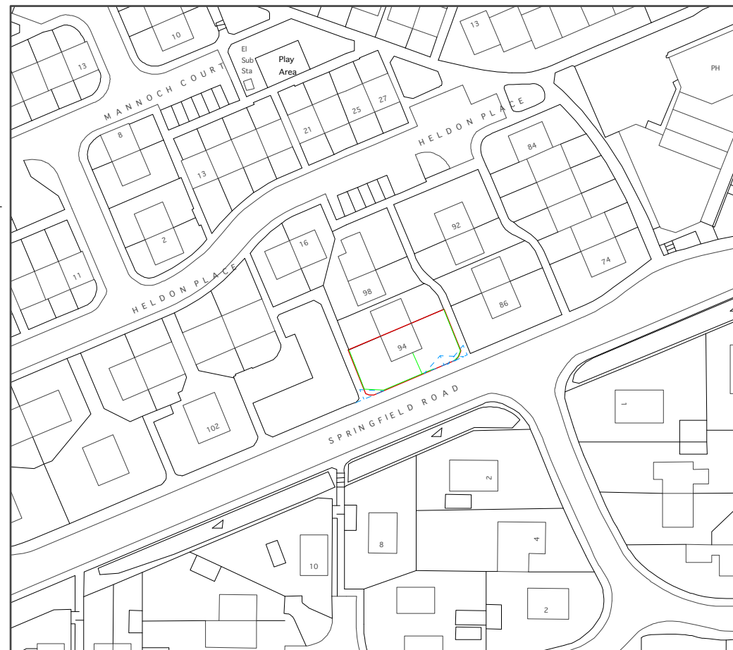
LOCATION PLAN 1-1250