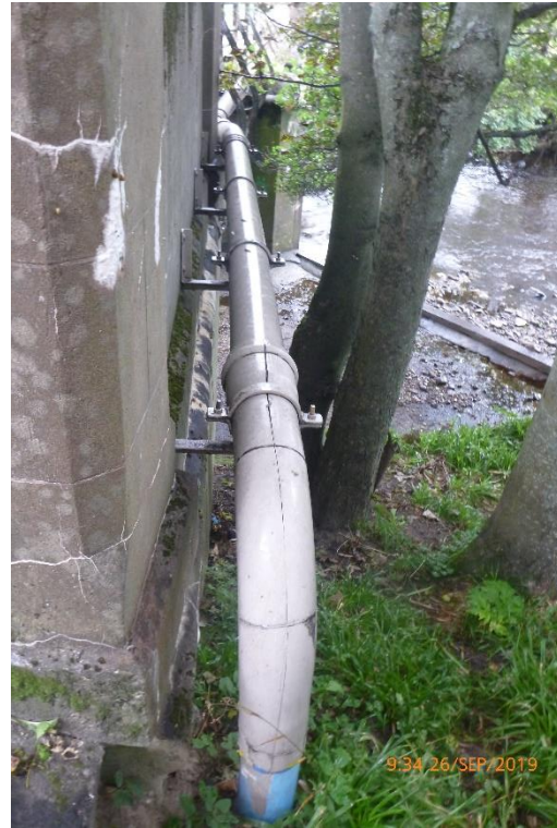
Photograph 31: Pipeline attached to South of structure.