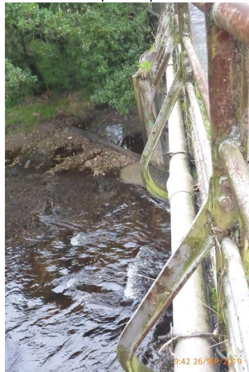
Photograph 9: View of pipeline passing through parapet bracing members on the South side.