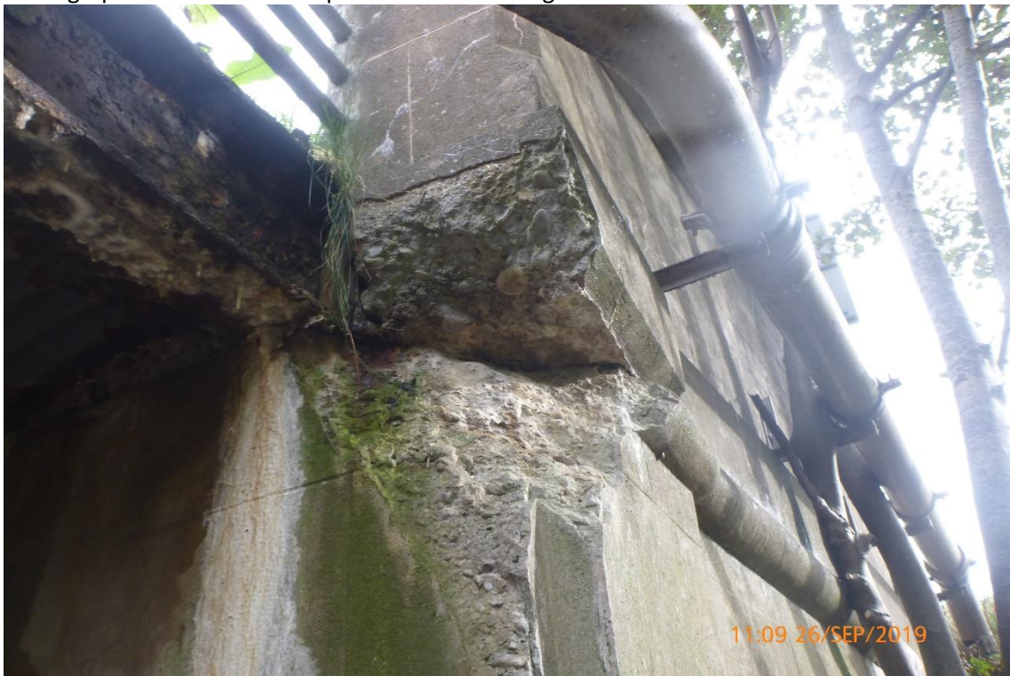
Photograph 27: Concrete breakout at East abutment / wingwall.