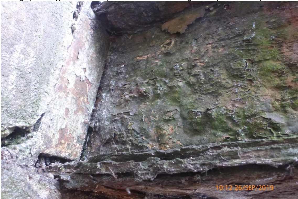
Photograph 13: Typical view of exposed beams faces with significant patina build up.