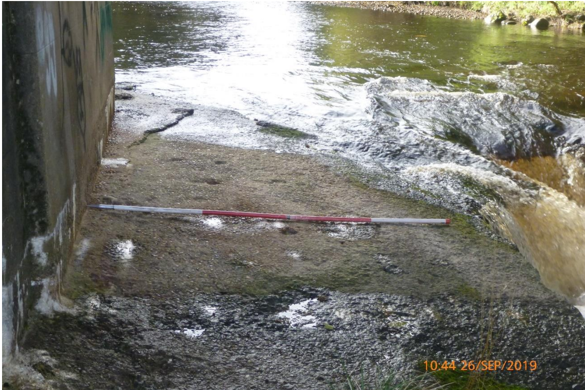
Photograph 26: distance from pier face to scour edge.