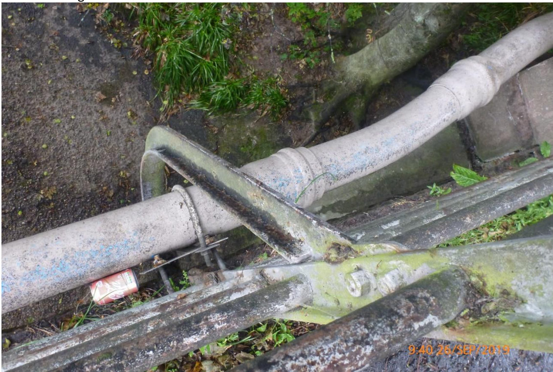
Photograph 32: Pipeline connection to bridge parapets.