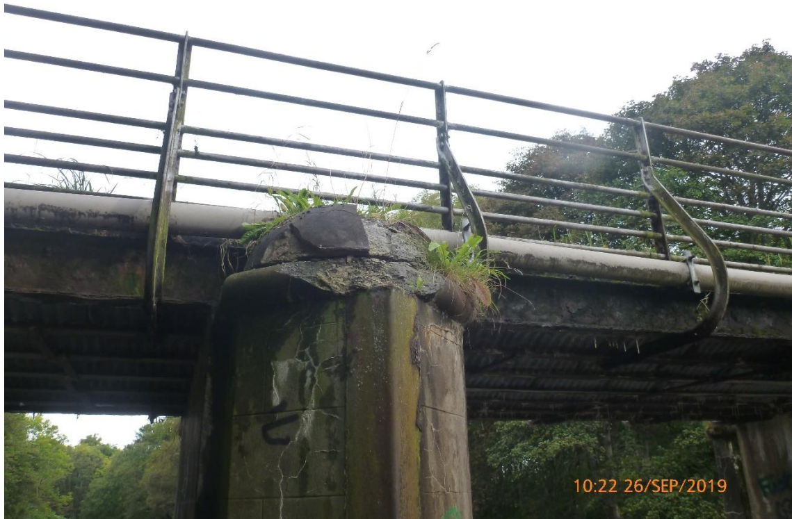
Photograph 22: Typical example of concrete break out at cutwater.