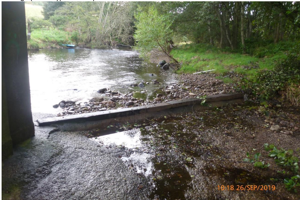
Photograph 23: River training works at upstream of Span 1.