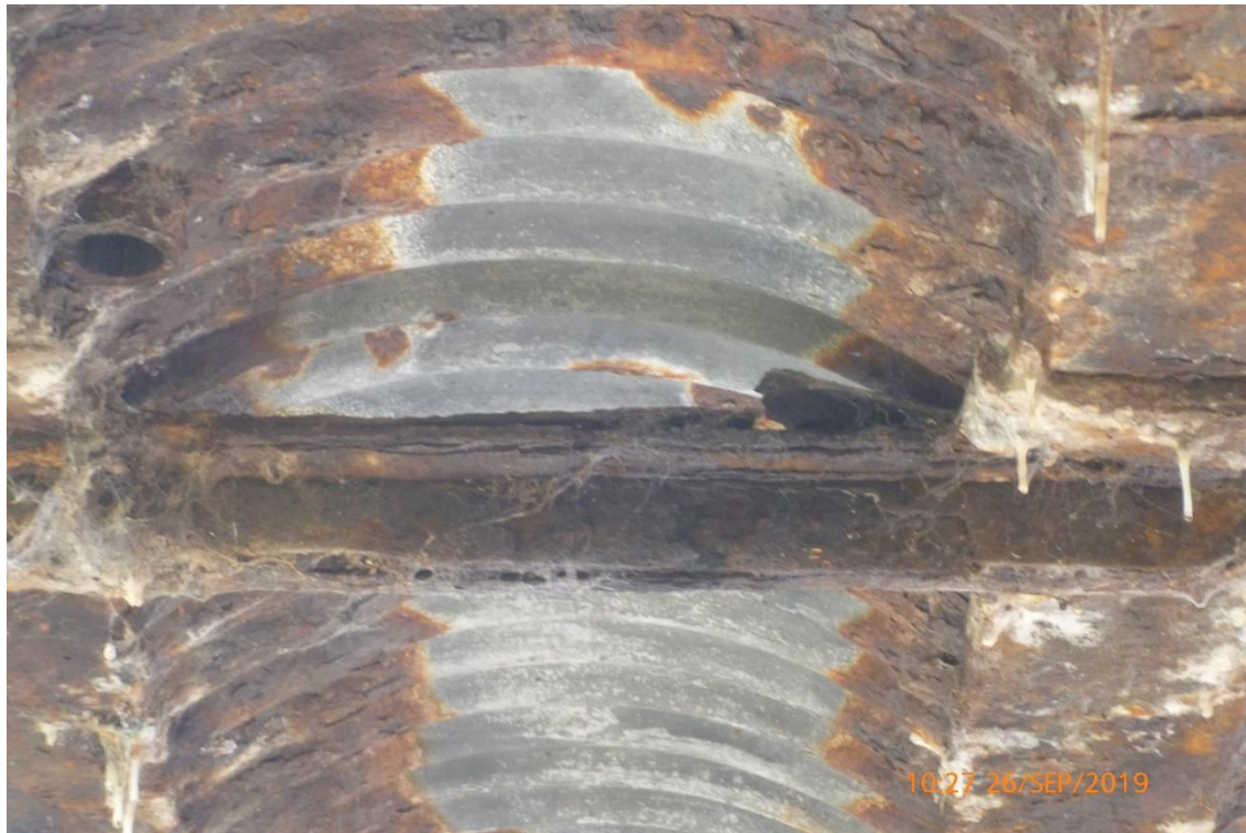
Photograph 16: Significant corrosion to parapet bracing member.