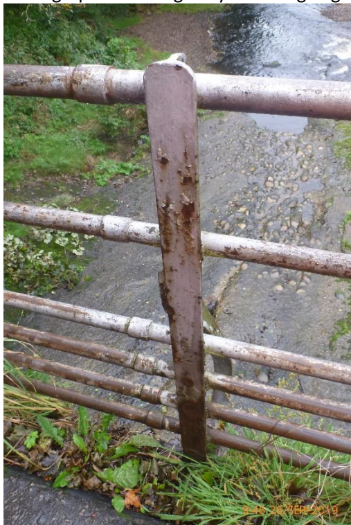
Photograph 8: Typical section of parapet corrosion.