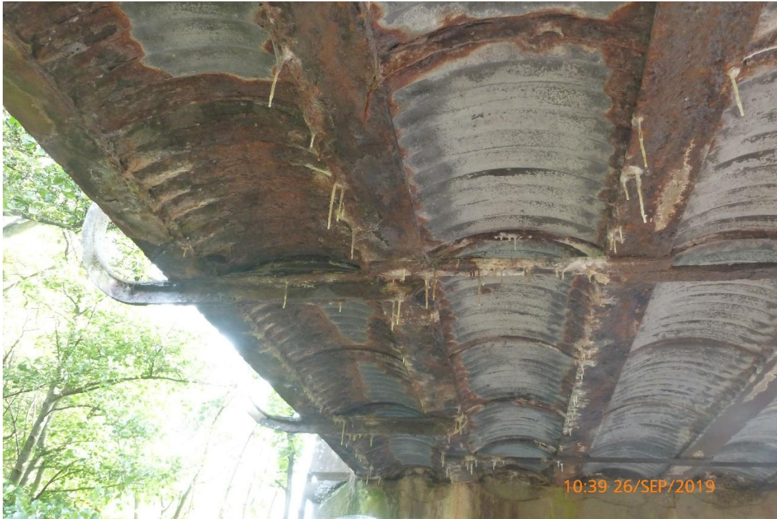
Photograph 10: Typical view of corrosion / rusting and calcite stalactites on bridge invert.