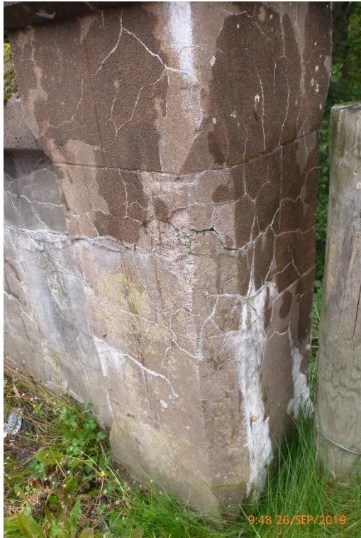
Photograph 33: Parapet impact and concrete crushing, North-East.