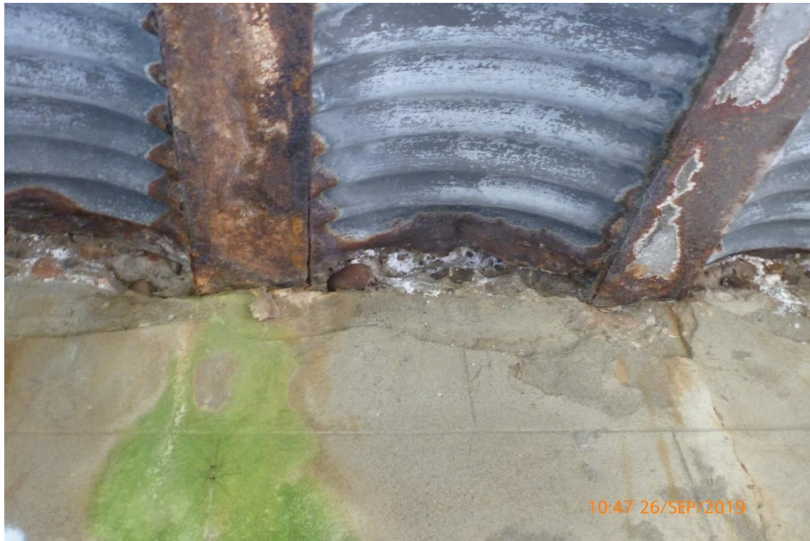
Photograph 20: Spalling of concrete between and under beams. Algae aggregate sizes visible