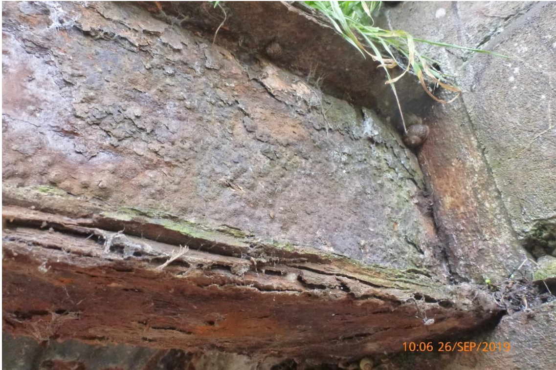
Photograph 12: Typical view of exposed beams faces with significant patina build up.