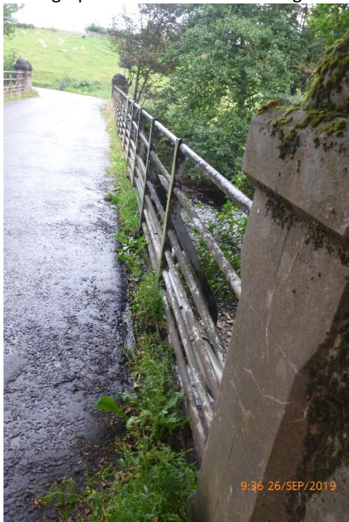
Photograph 6: Vegetation growing at edge of carriageway with no verge.