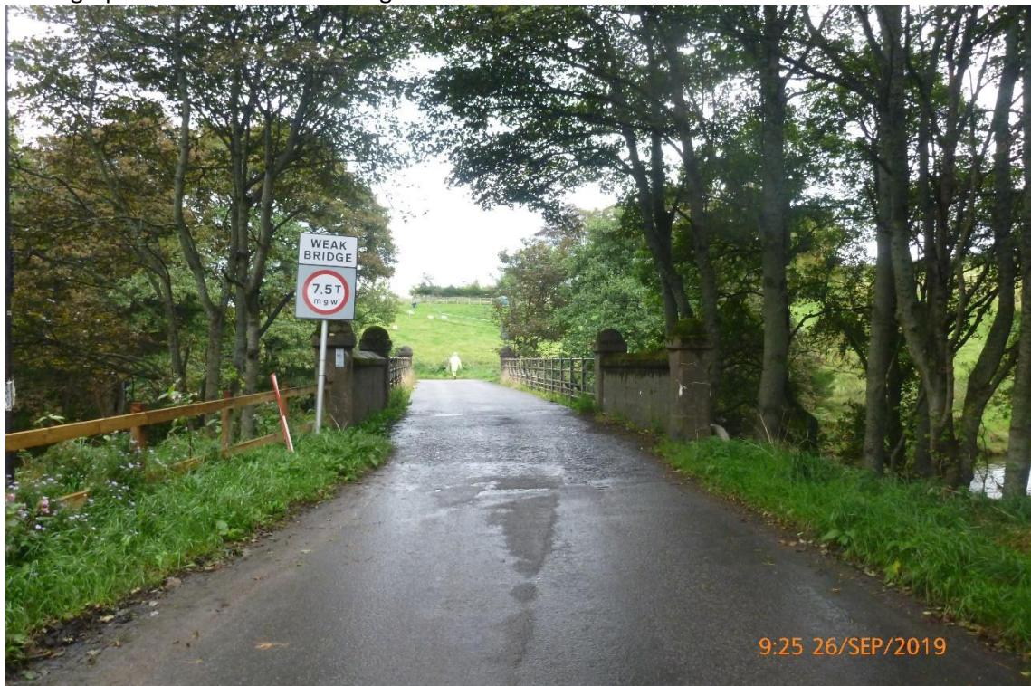
Photograph 4: General View Looking East