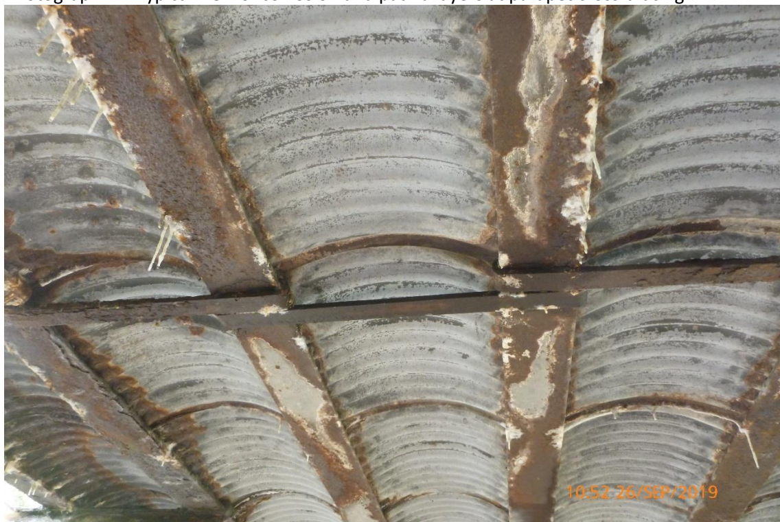
Photograph 15: Typical view of transverse bracing members.