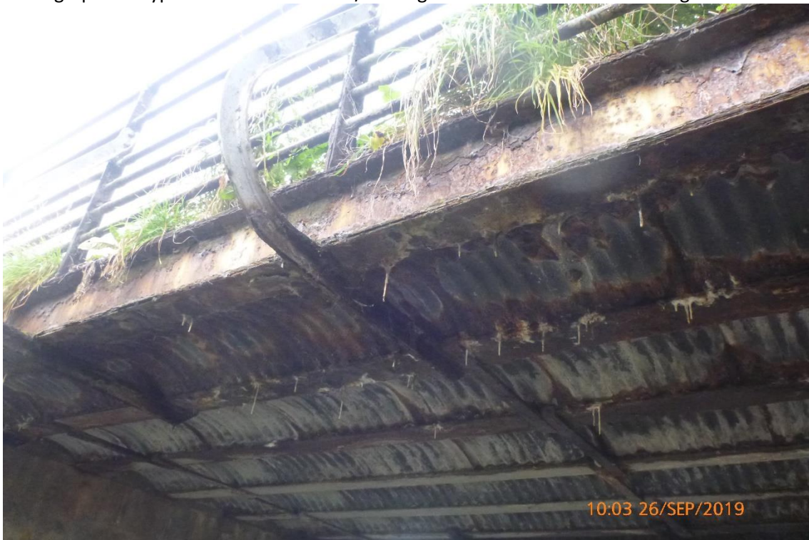
Photograph 11: Typical view of corrosion to outside beams and corrosion to bottom of bracing members.