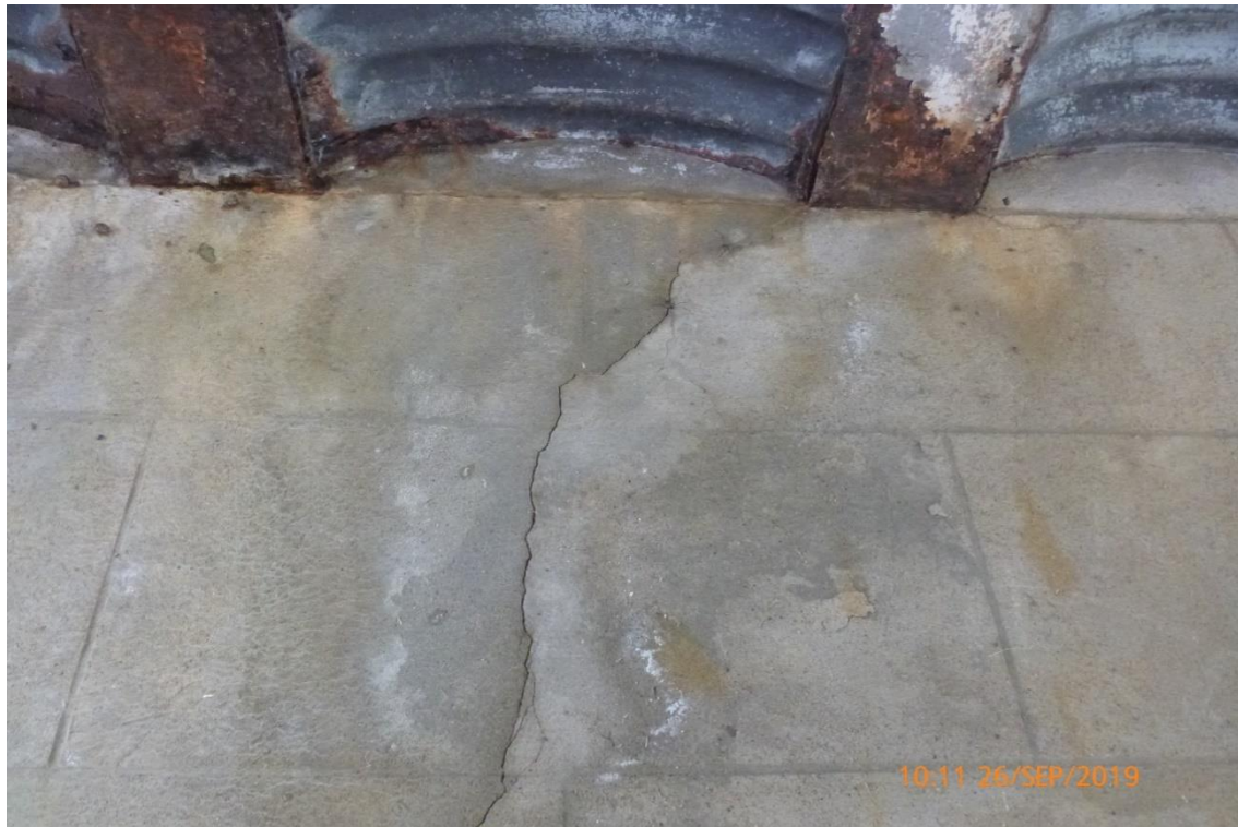
Photograph 18: Vertical Crack on West Abutment starting from beam (0.8mm).