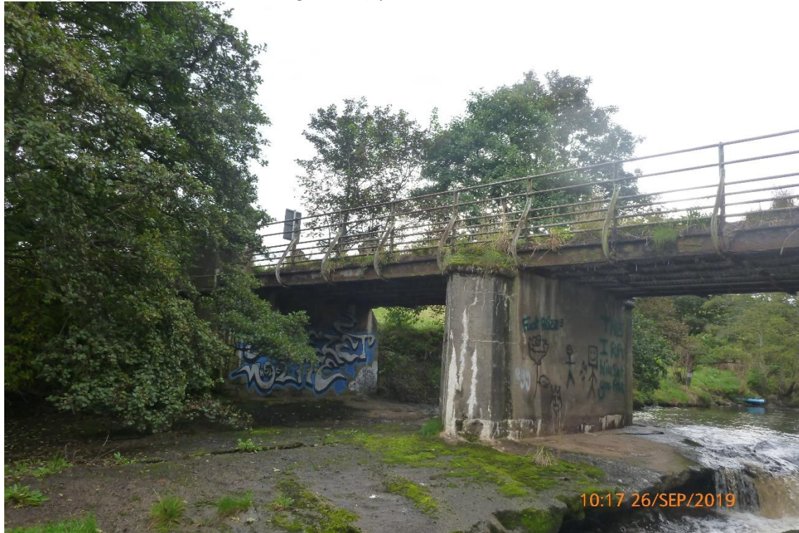
Photograph 2: General View Looking East