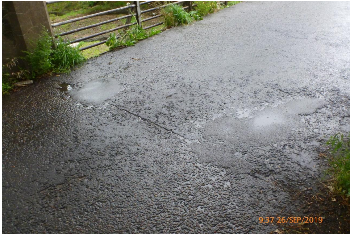
Photograph 7: Carriageway surfacing in good condition with minor patch repairs. No Joint visible.