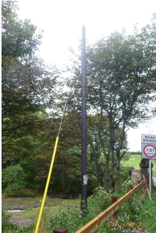
Photograph 30: Overhead telecoms cable to North of bridge.