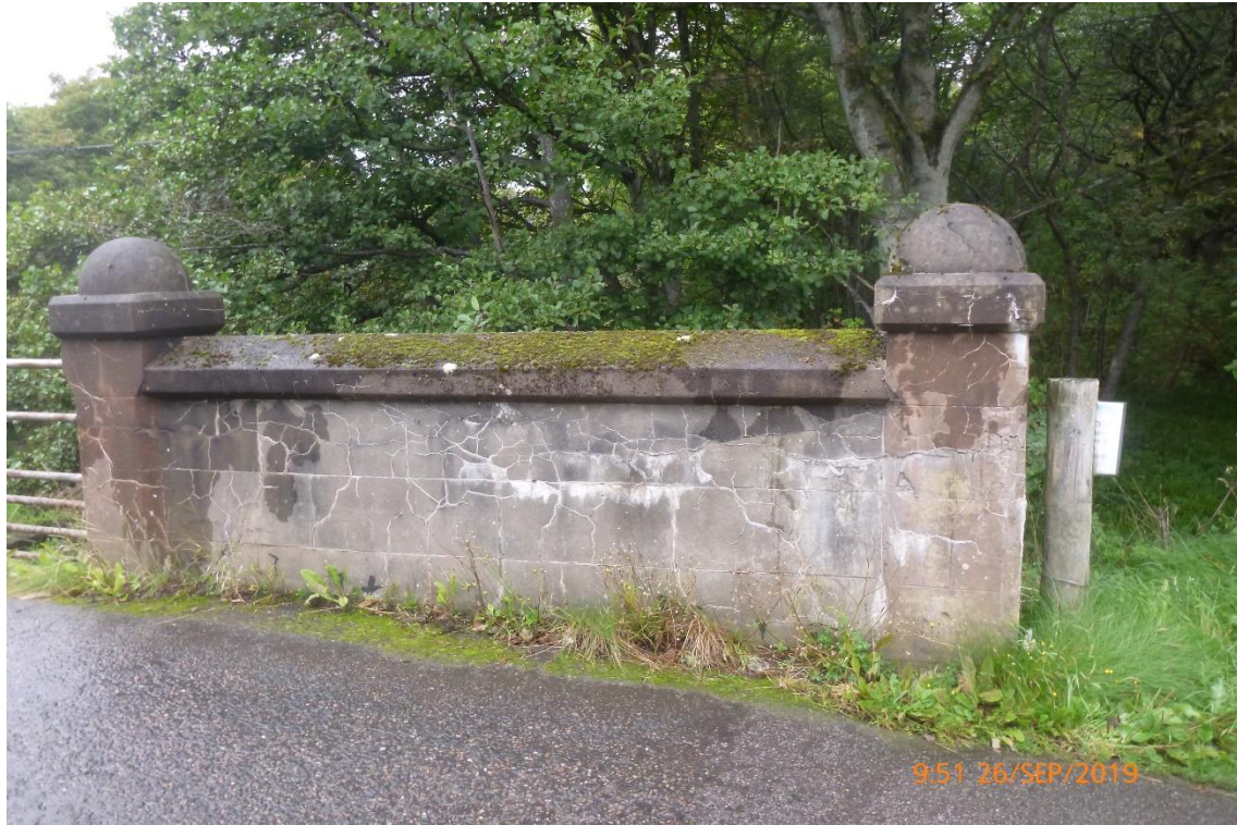
Photograph 35: Typical condition of parapet with cracking and crazing.