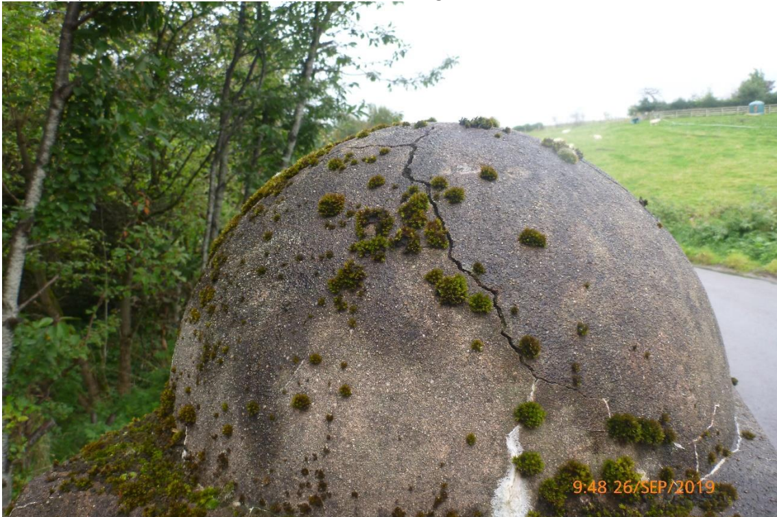
Photograph 34: Cracking of Wingwall parapet topping stone (North-East)