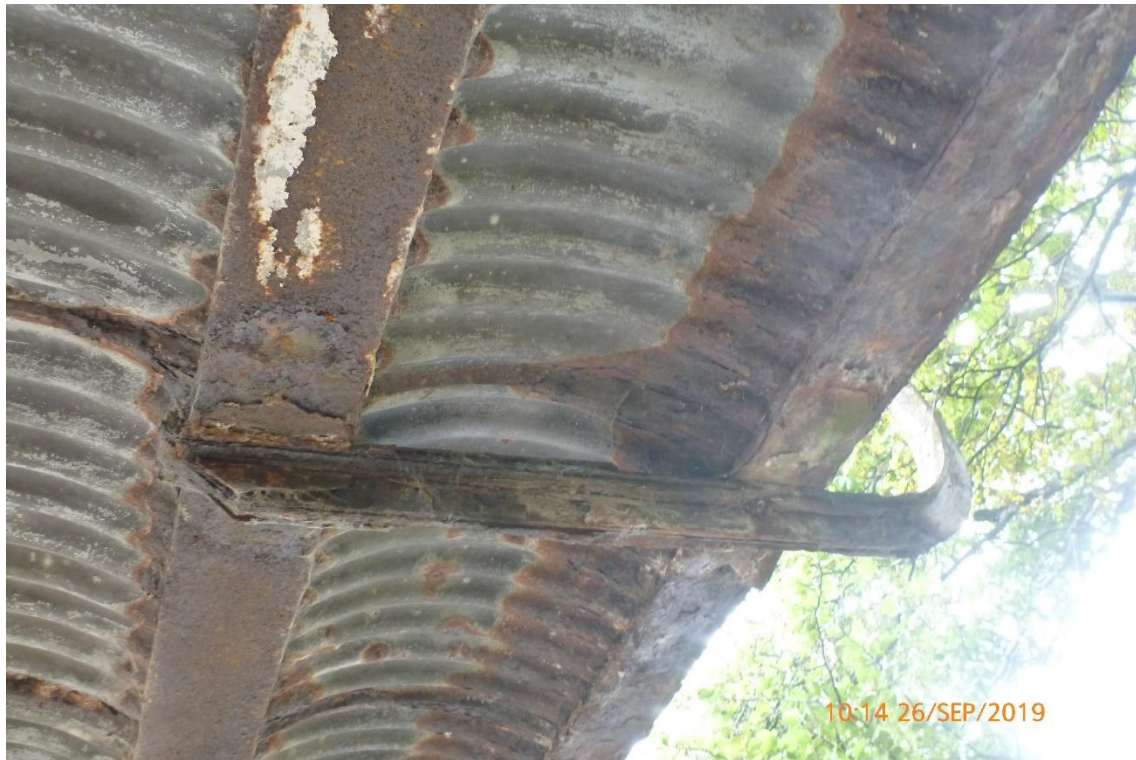
Photograph 14: Typical view of corrosion and patina layers at parapet cross bracing.