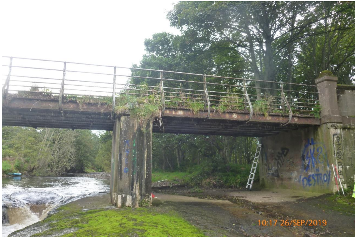
Photograph 1: General view looking South (Span 1)