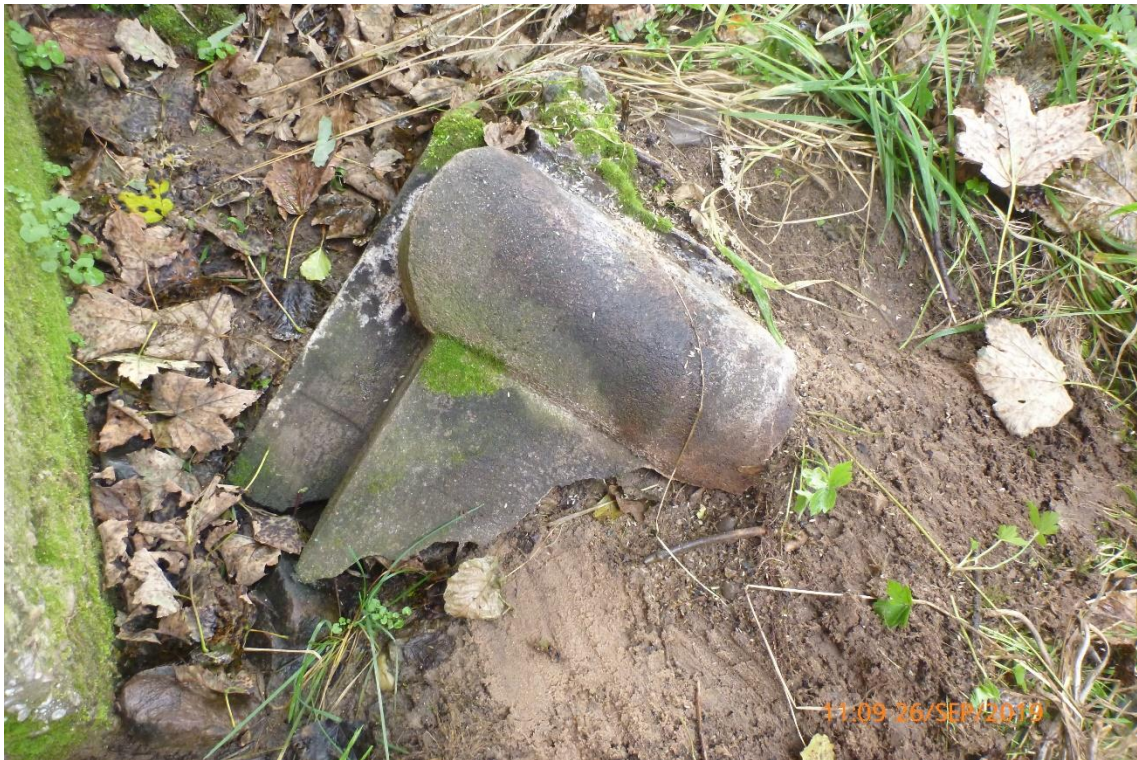
Photograph 28: Concrete breakout at East abutment / wingwall