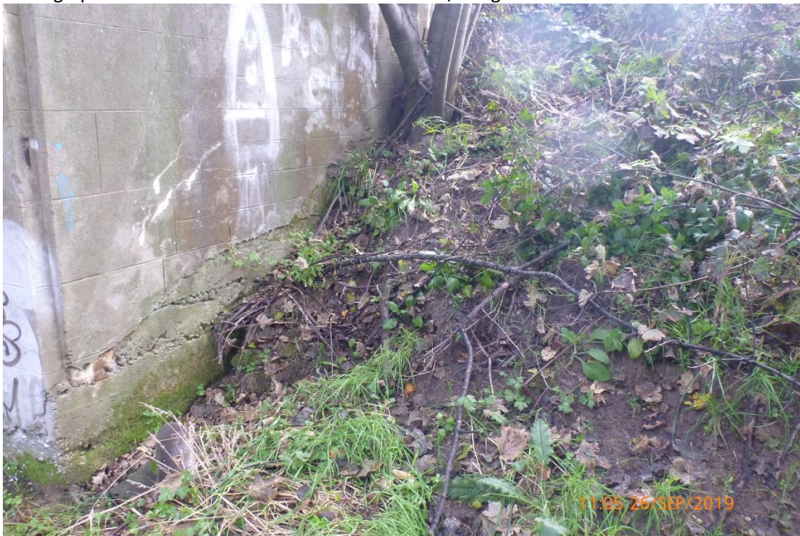
Photograph 29: Minor scour to embankment and wingwall (South-East).