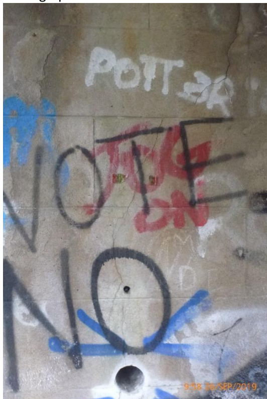
Photograph 19: Vertical crack on West Abutment, with broken crack gauge (0.8mm)