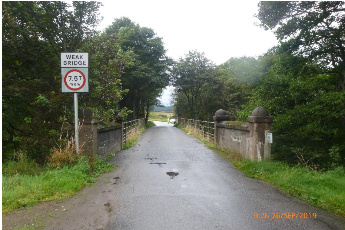
Photograph 5: General View Looking West.