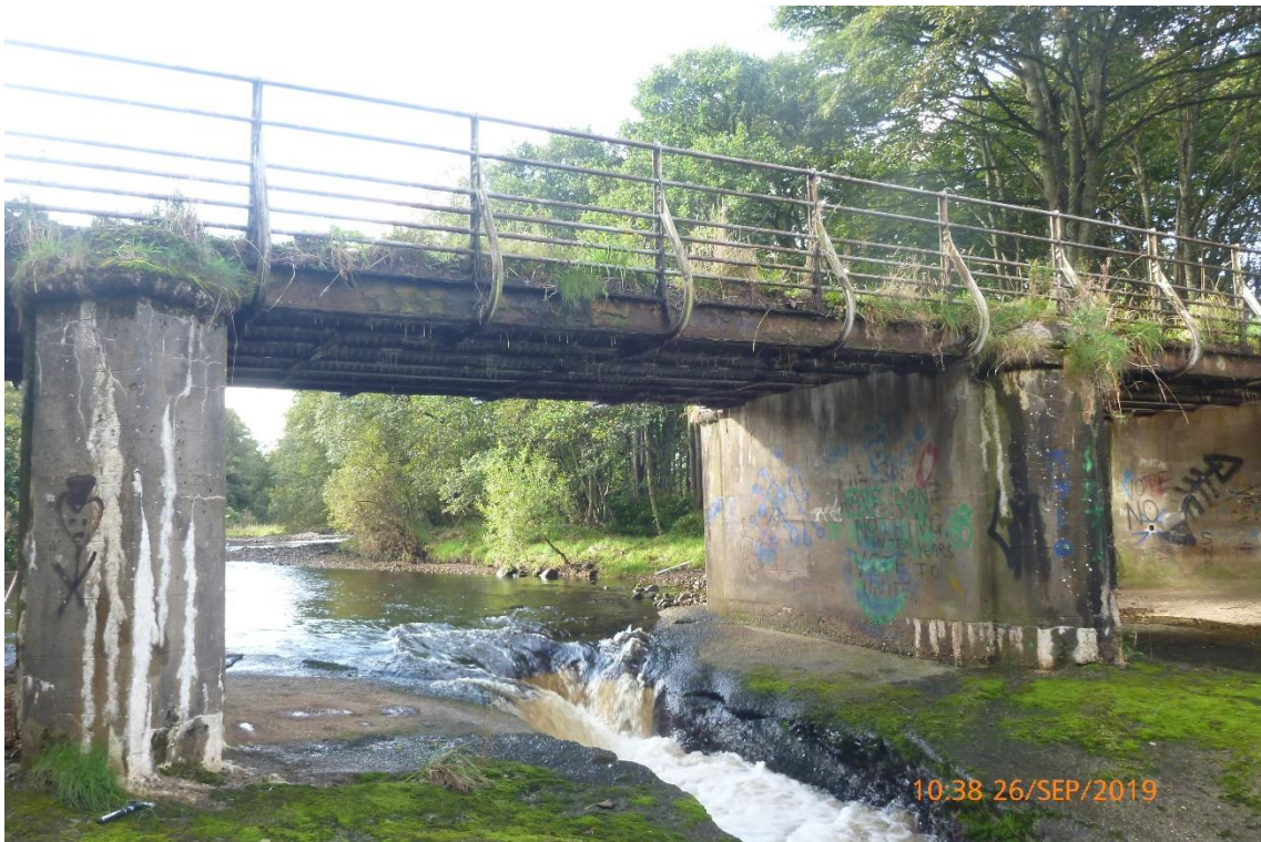
Photograph 25: General view looking South at centre span with invert scour.