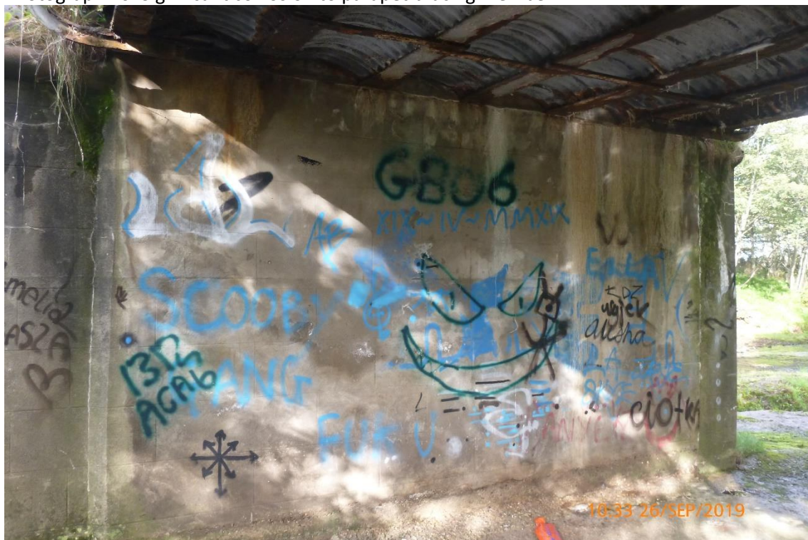
Photograph 17: Example of graffiti present on all abutment and pier faces.