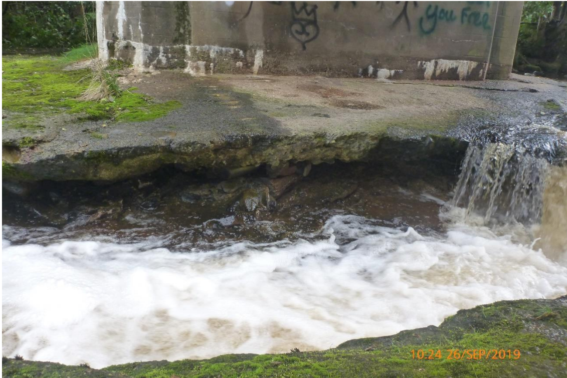
Photograph 24: Scour of bridge invert at centre span. Visible scour extending beneath invert on East side.