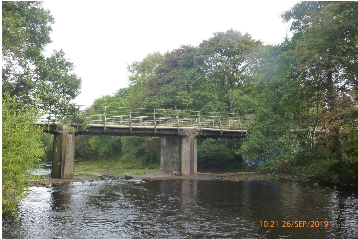
Photograph 3: General view looking North