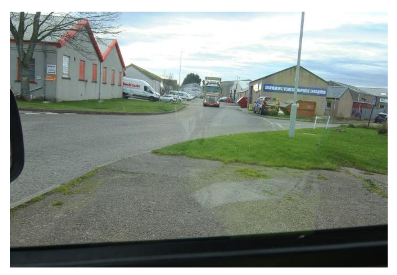
IN CAR VIEW TO SOUTH FROM SITE ACCESS (TOWARDS DIAGONAL ROAD)