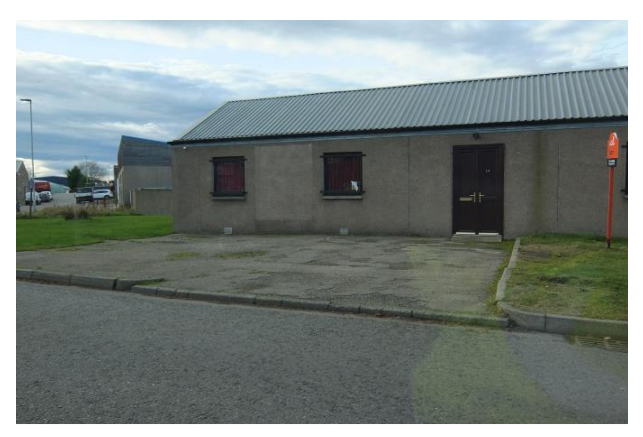
EXISTING 4.7M WIDE ACCESS AND OPEN SITE FRONTAGE