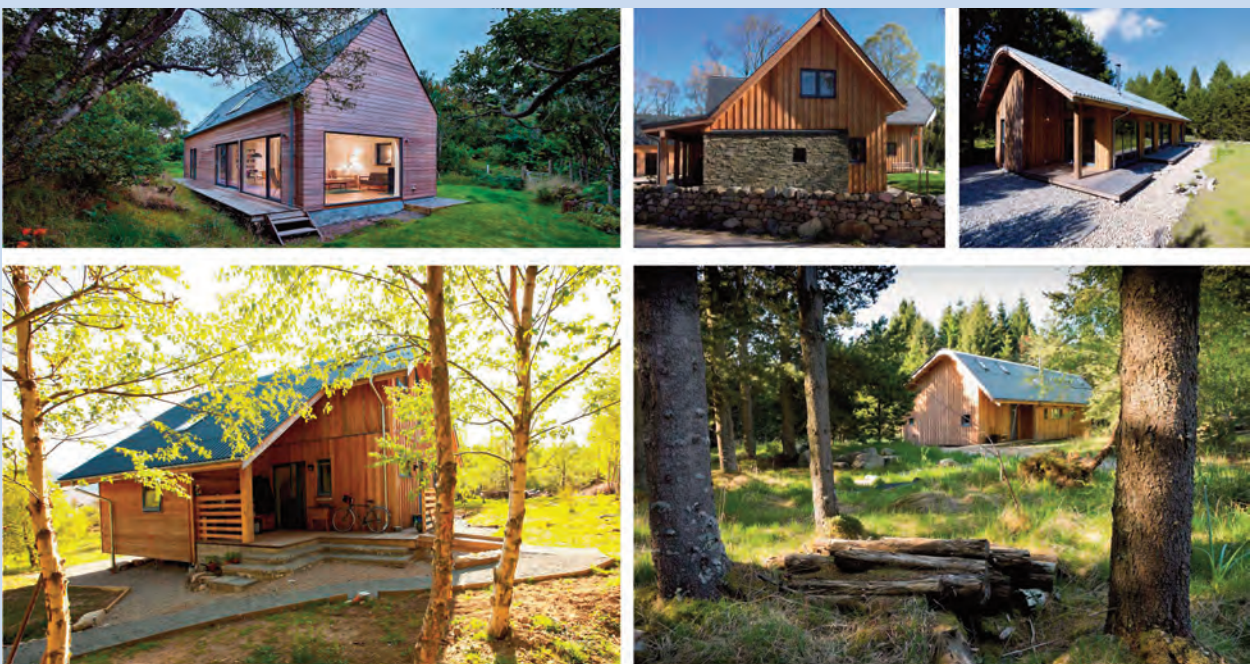
Examples of homes within woodland in Northern Scotland