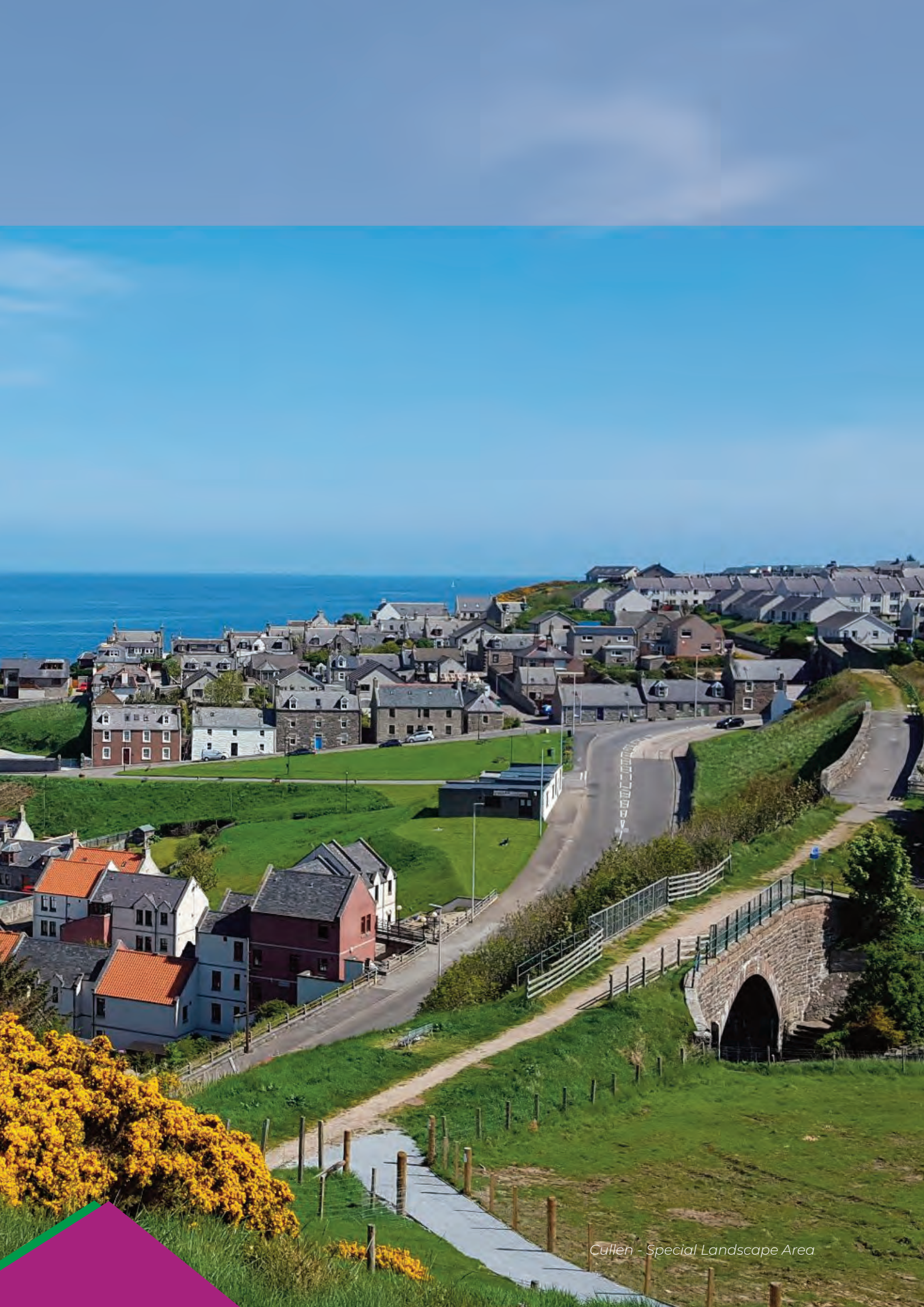
Cullen - Special Landscape Area