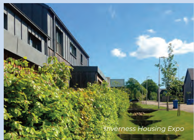
Inverness Housing Expo