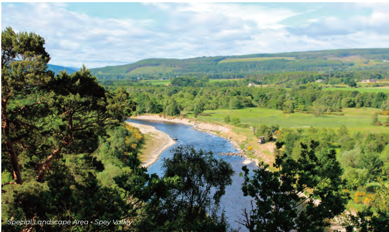
Special Landscape Area - Spey Valley

Progress: Complete. Quality Audit 2 has been developed and is ready for implementation upon adoption of the new Local Development Plan.