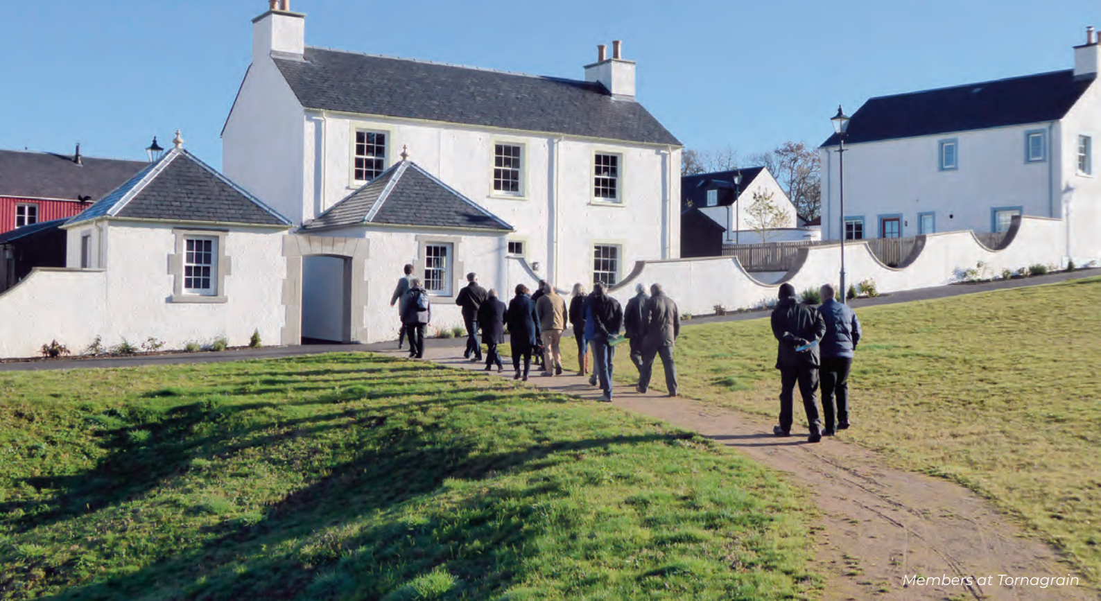
Members at Tornagrain