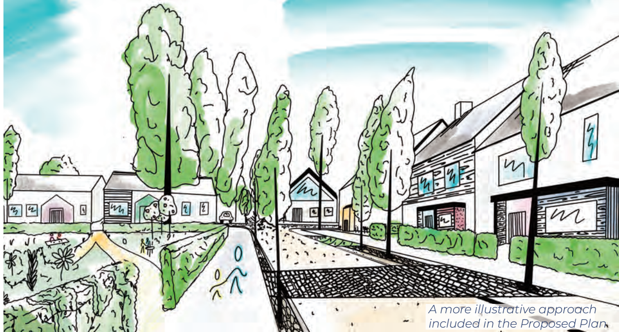
A more illustrative approach included in the Proposed Plan.

Commitment: Review our desk duty service.