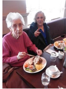
Enjoying time out and about in Moray and our Shared Lives Craft Group had lots of fun making "fairy doors" together.