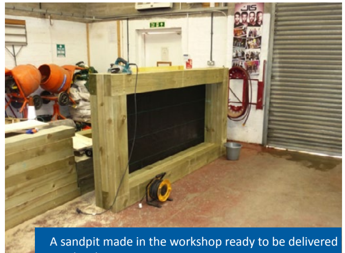
A sandpit made in the workshop ready to be delivered to a local Nursery