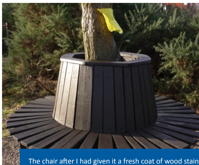
The chair after I had given it a fresh coat of wood stain