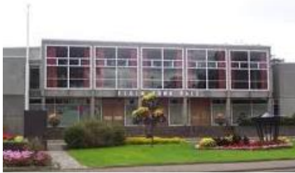
Elgin Town Hall