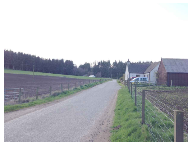
Visibility looking west Current Situation