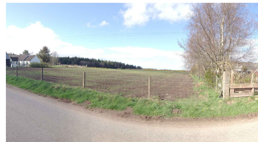
Potential access point Current Situation