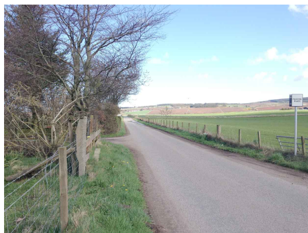
Visibility looking east Current Situation